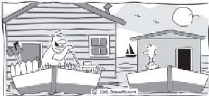
The only problem with this old houseboat is the basement leaks

Q My family loves to spend the whole weekend away on our twenty-four foot cruiser. We don't have refrigeration, only an ice box and use ice blocks to keep the food fresh. I'm tired of ending up with food floating in cold, bloody water & labels floating in the soup by the second day out.