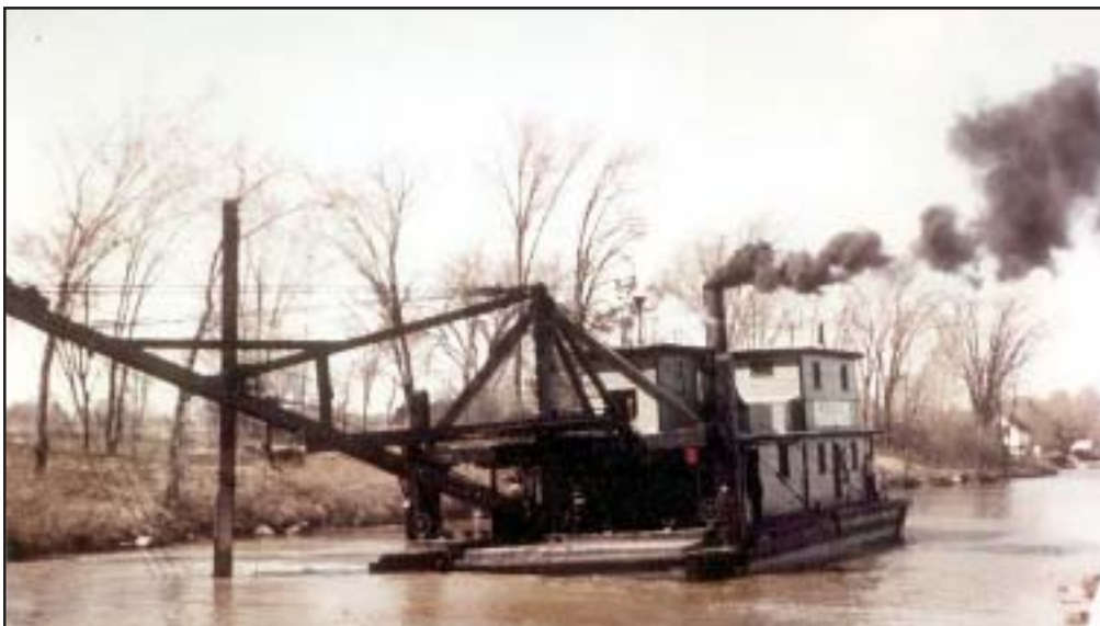
The dredge 'Rideau' at Hartwells