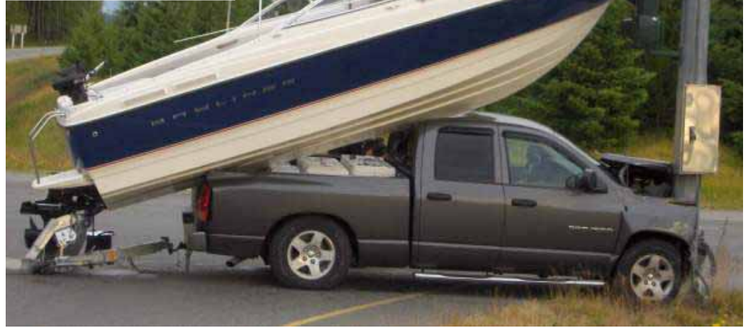
Notice the three beer coolers