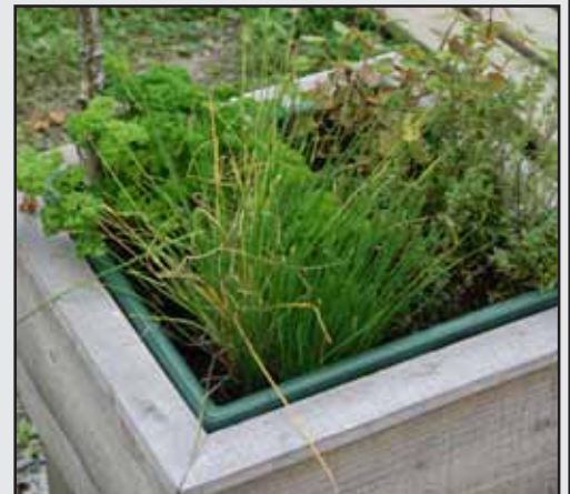
One of four herb planters at the north patio