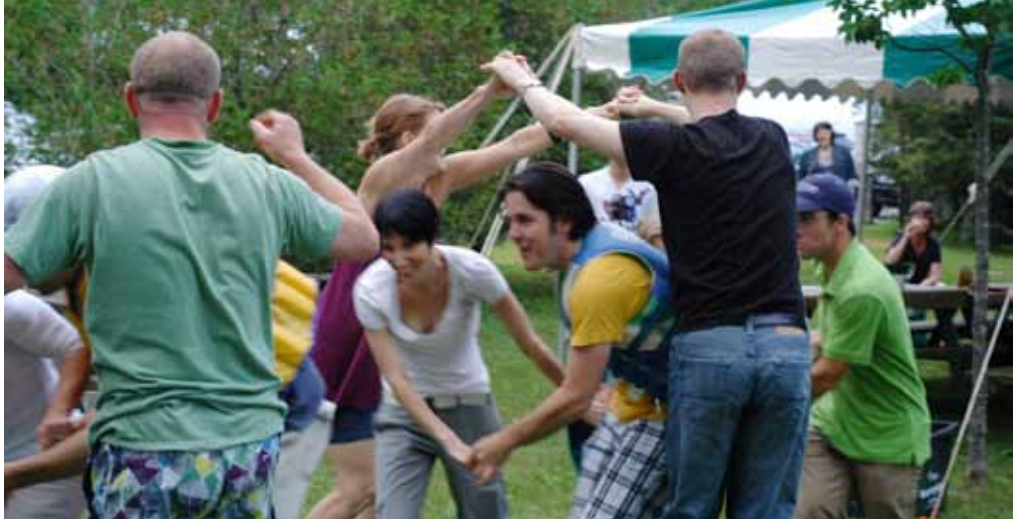
'The Fog' got us all jigging